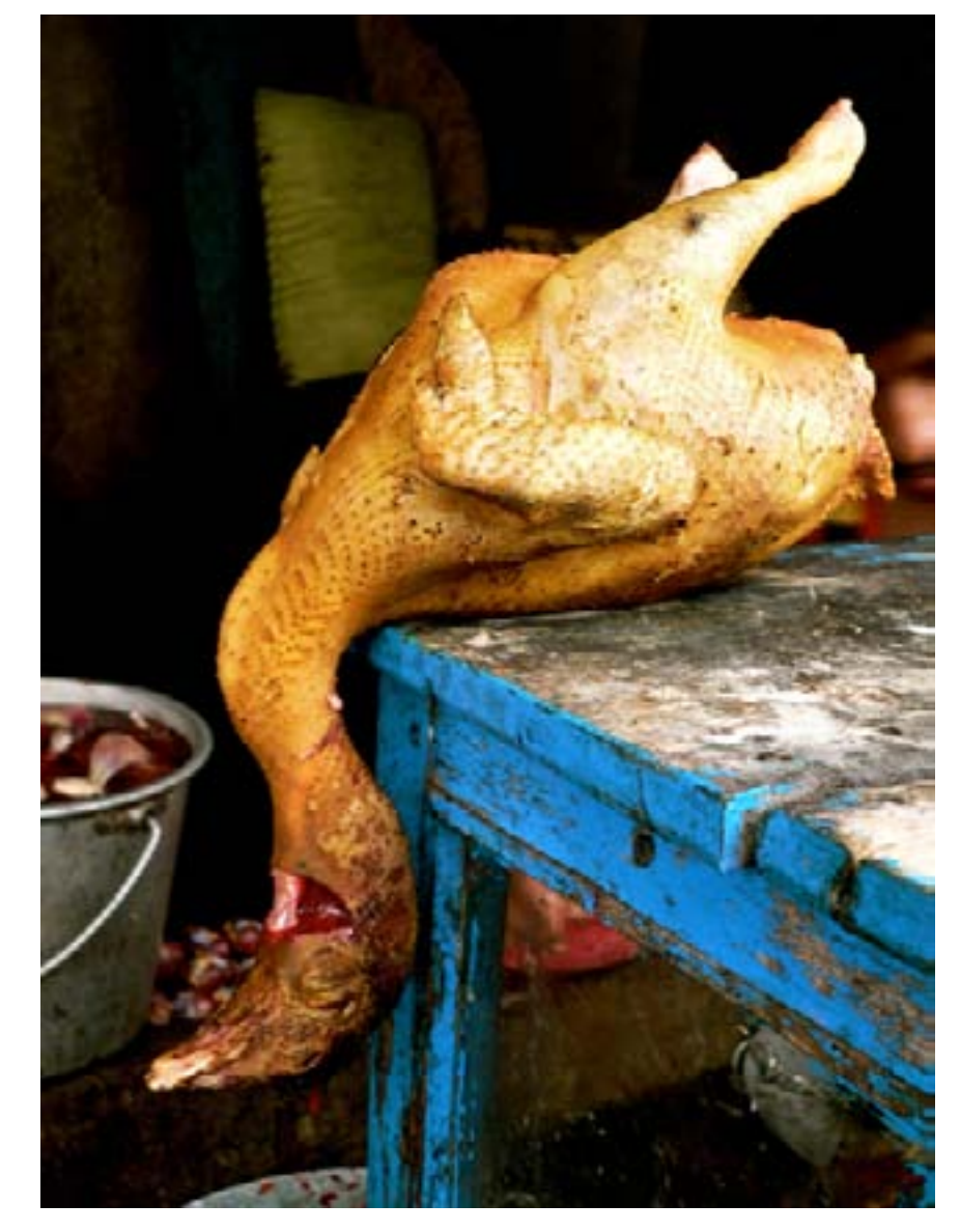
ZIP Allison Fontaine-Capel