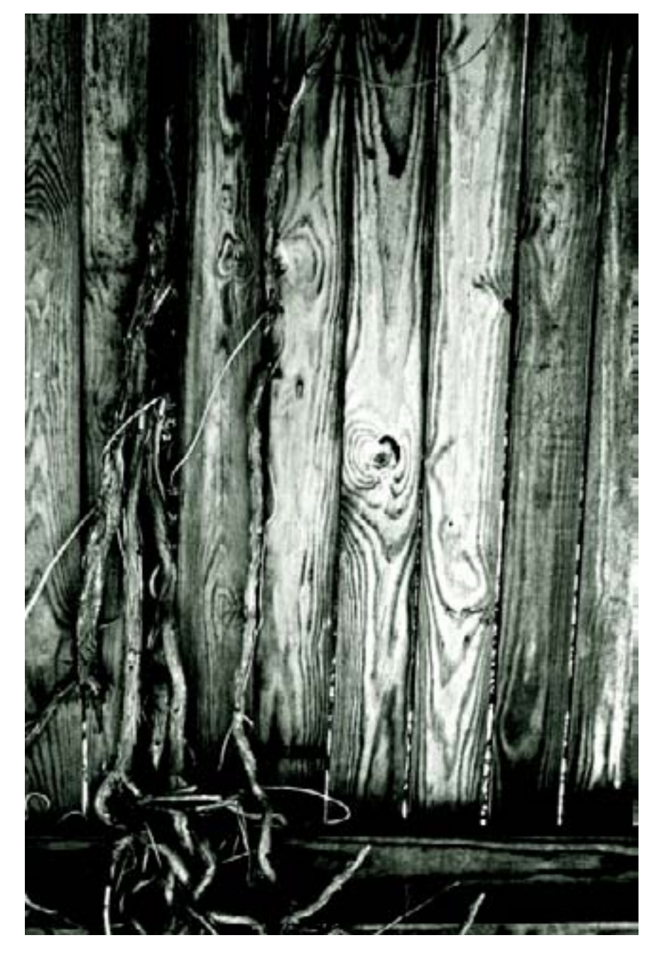
All is on\ Fontaine-Capel