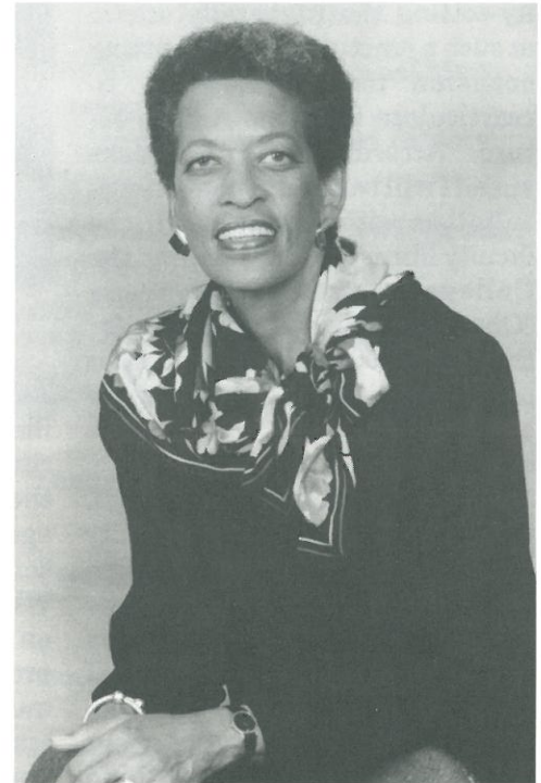
Johnnetta B. Cole

Dr. Cole was named President of Spelman College in 1987. As the first African American woman President of Spelman, she has led the historically black college for women on a path of sustained improvement into the ranks of America's best colleges. At her inauguration, Drs. Bill and Camille Cosby gave $20 million to Spelman, the single largest gift from individuals to an historically black college or university.