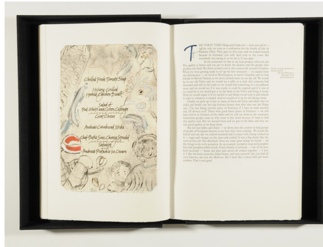
Menu and essay from Solche Sensationen

Brill's Encyclopedia of Hinduism , 2009. The five-volume encyclopedia presents comprehensive research on all aspects of the Hindu religious tradition, from ancient to contemporary times. Among topics covered are the global spread of Hinduism over the last 200 years, the interaction of Hinduism with other religions, and the various responses of Hinduism to contemporary issues such as feminism, human