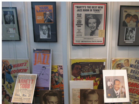
Memorabilia from the Neumann Collection