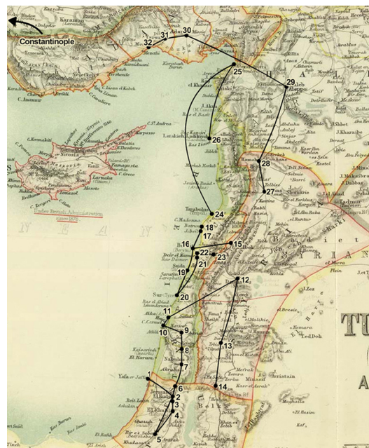
Map of King-Crane Commission route

The website for the collection, which was unveiled in August, includes an extensive introduction to the members and work of the commission, a description of the scope of the collection, advice for researching within the collection, and an interactive map detailing the route the commission followed, with links to key documents and photographs associated with each stop along the itinerary.