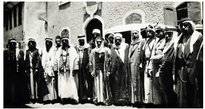
Druze delegation, Damascus, summer 1919

will continue to draw on it in her other courses. The collection, which is openly accessible on the Internet, is now available to students and scholars worldwide at www.oberlin.edu/library/digital/king-crane/ .