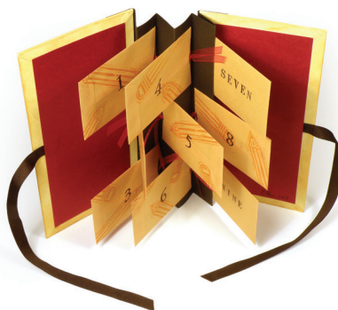
Elaine Chu, School Days

The Hughes Collection reflects the great diversity of materials, themes, and formats employed by book artists. Works in the collection range in size from 59 to just 6 cm, and incorporate a wide variety of materials such as clay, plastic, glass, wood, silk, plants, gloves, hair, a button, a mascara wand, paper, leather, cotton, silk, plants, and shredded money. The varying formats include the traditional codex as well as the accordion style, miniature books, flagbook