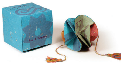
Alice Austin, Box of Happiness

structures, scrolls, and pop-ups. The themes addressed range from those that are playful and humorous to those that explore serious political and spiritual concerns.