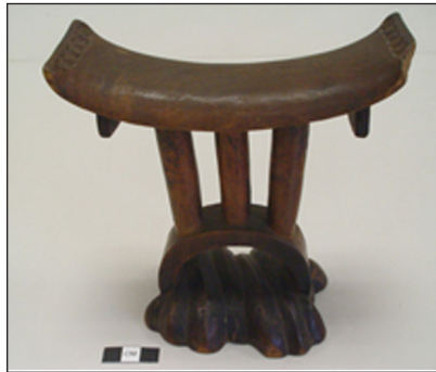
Head Rest (Mozambique)