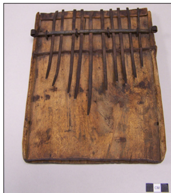
Thumb Piano (Mozambique)

She selected works for the missionary collection sample for their interdisciplinary value. In addition to aiding the study of anthropology, these representative pieces are relevant for students of religion, African