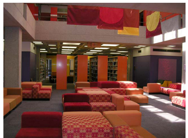
Refurbished Second Level

Library nappers will be delighted to discover that the cushions in the center section of the second level have been reupholstered. The banners that hang over the cushions from the skylight in the East Asian Collection reading area also have been replaced with