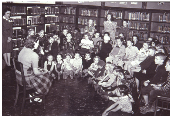
Public Library Story Hour