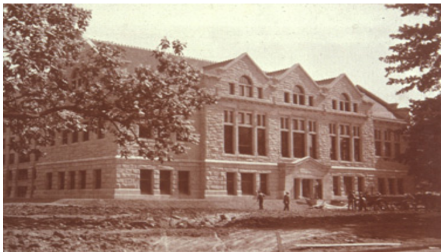
Carnegie Library Nears Completion, 1908

In conjunction with the College's 175th anniversary celebrations, the Oberlin College Library and the Oberlin Public Library are co-sponsoring a program entitled "Remembering Carnegie: A 100th Anniversary Celebration." The event will be held in the Carnegie lobby on Saturday, October 4 at 4 p.m. and will include a short documentary film, slides, and panelists from the College and Town who will share remembrances. Audience members will also be invited to convey their memories as part of the celebration. The program will be followed by a reception.