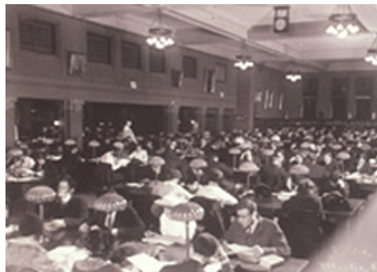
Carnegie Reading Room, 1920s

The Carnegie Library opened its doors in 1908 and served for decades as the library for both Oberlin College and the Town of Oberlin, an arrangement that was unusual in its day and remains rare even today. The story of how Oberlin was given money for the building by Andrew Carnegie is an intriguing one, involving forgery, theft, and a fetching woman who effectively deceived dozens of people into believing she was Carnegie's illegitimate daughter.