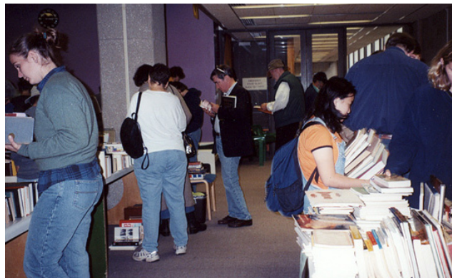
Books: Plentiful and Cheap