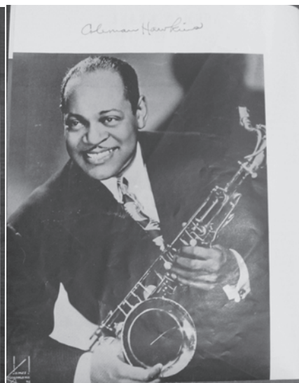
Program for the Cleveland "Jazz at the Philharmonic" concert produced by Norman Granz, autographed by Coleman Hawkins and others