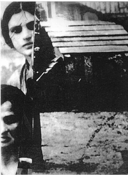
Print from Carol Rosen's Holocaust Series

Rosen's artists' books are bound as loose folios, each page an individual print facing associated text. Constructed from archival photos, TV images, and other relevant imagery, Rosen's photo/collages are printed on translucent, parchment-like material that appears worn, avoiding the technical perfection often associated with photography and heightening the intimacy between the viewer and the image.