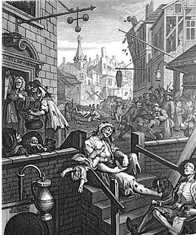
Hogarth's Gin Lane

and history of England, especially the city of London. He also collected materials relevant to American history, travel and discovery. He had a particular fondness for the concept of place in its multidisciplinary complexity and collected many maps and prints on transportation history and cartography with supporting secondary literature. Among the more noteworthy items are several early road maps of London and a number of original prints of engravings by William Hogarth in pristine condition, including the well-known "Gin Lane" reproduced above.