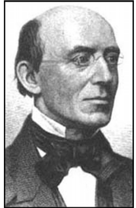
William Lloyd Garrison